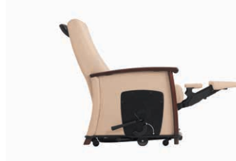
54981W patient recliner