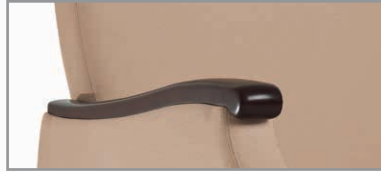
wood arm caps