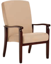
54471WB22 patient chair