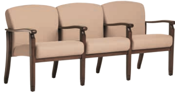
54410-3TW 3 seat tandem