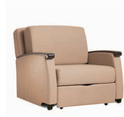
54841W30 sleep chair