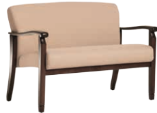
54411WB40 bariatric loveseat