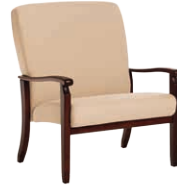
54771WB30 wall saver bariatric patient chair