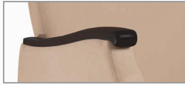
urethane arm caps