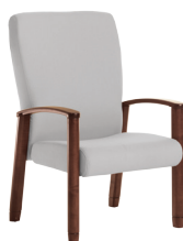
53471WB22 patient chair