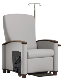
53981W patient recliner