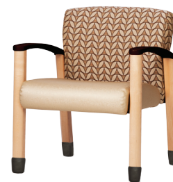
54411UB22 with protective boot