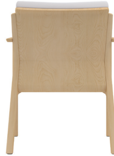
6341122 shown with wood under seat and outer back panel (standard)