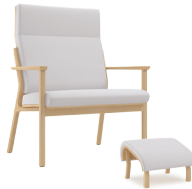
6347130 and 6340100 bariatric patient chair and ottoman