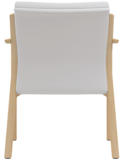
6341122 shown with fully upholstered seat and back (optional)