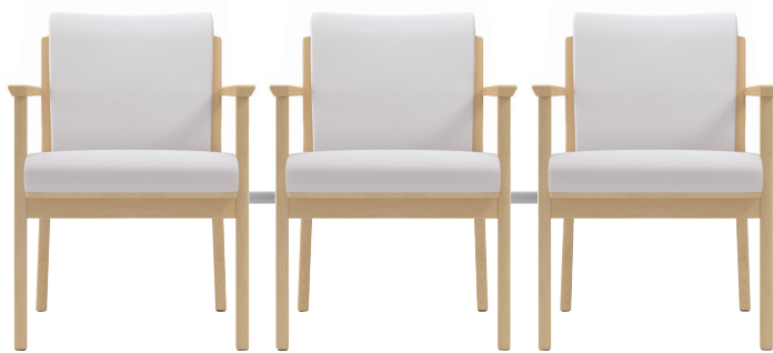
6341122 shown with ganging assembly