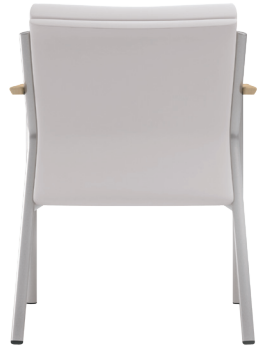
6351122 shown with fully upholstered seat and back