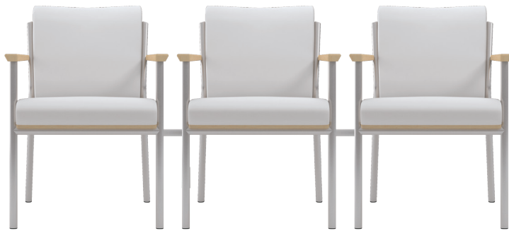
6351122 shown with ganging assembly