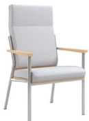
6357122 and 6350100 wood seat and back