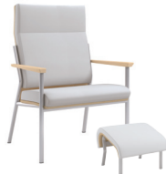
6357130 and 6350100 bariatric patient chair and ottoman