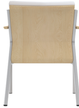
6351122 shown with wood panel seat and back